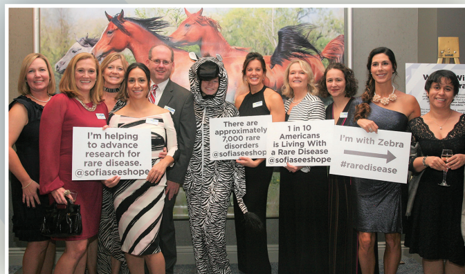
Dinner in the Dark 2019 Event Committee

In some ways, learning to live during this pandemic is like those days right after you get that diagnosis of LCA, either for yourself or your child. You're stunned. Speechless. Maybe knocked down. But you come to grips with your current situation, and you pivot. You adapt and you move forward. You continue to live your life and look to the future. That's what we're doing, and we hope you are too.